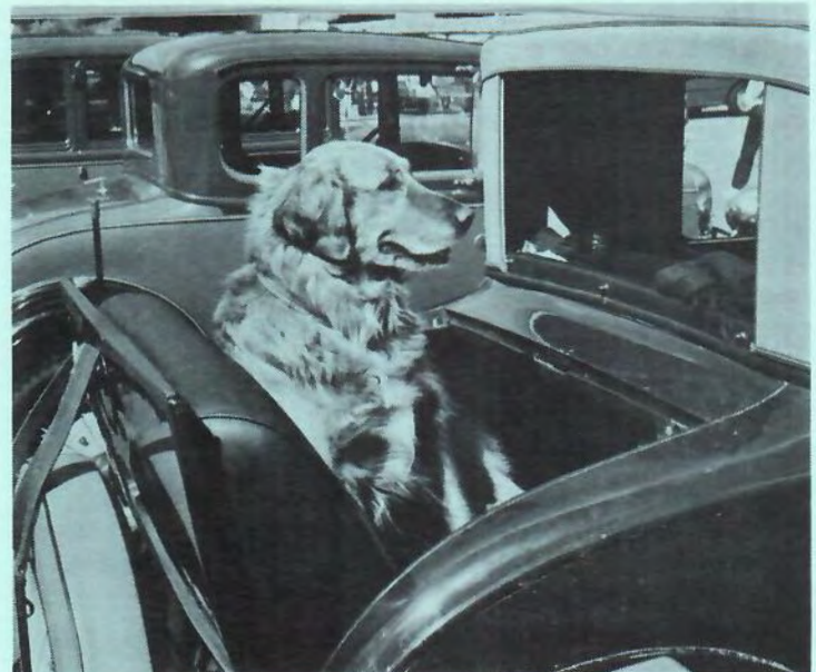
I just "love" Rumble Seats